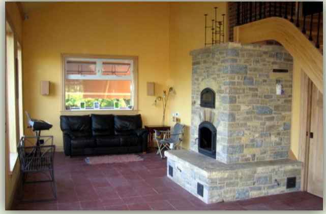
Masonry Stove & Living Room