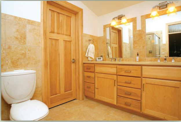
2-sink Family Bath